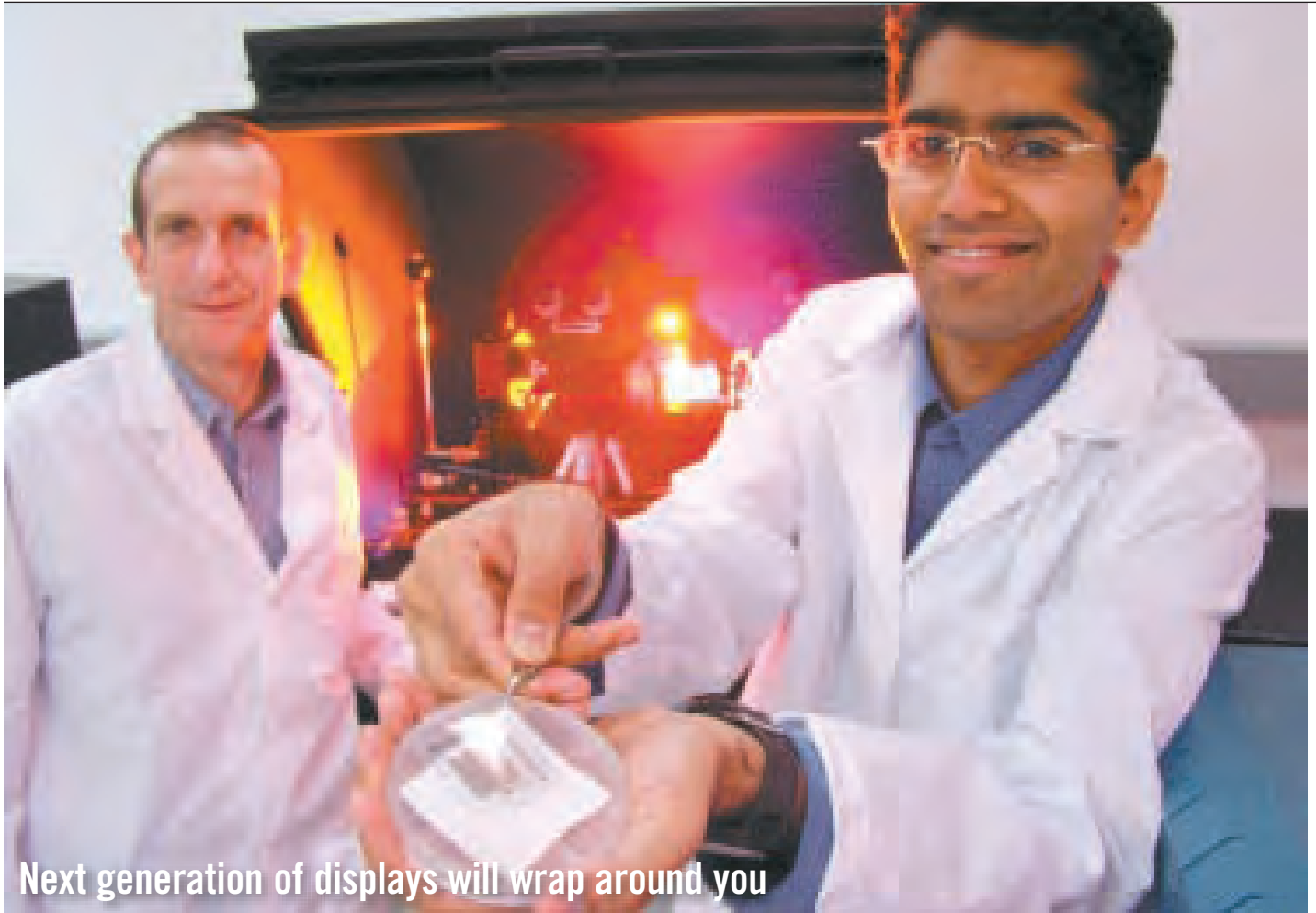
Next generation of displays will wrap around you